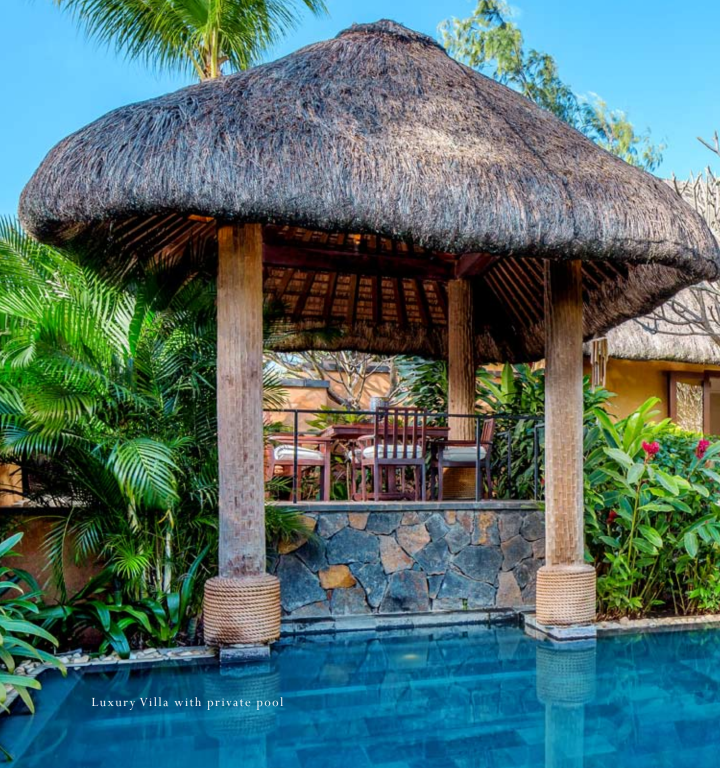
Luxury Villa with private pool